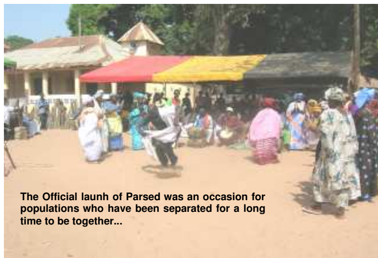
The Official launch of Parsed was an occasion for populations who have been separated for a long time to be together...

based in Ghana, the West African Network for Small Arms is now legally registered since October 2006. Thanks to Oxfam GB funds, a well resourced and functioning secretariat has been set up as well as an operational office.